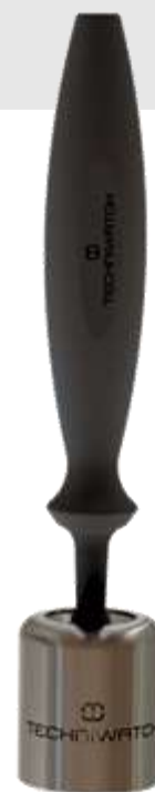
Case cleaning pen and holder